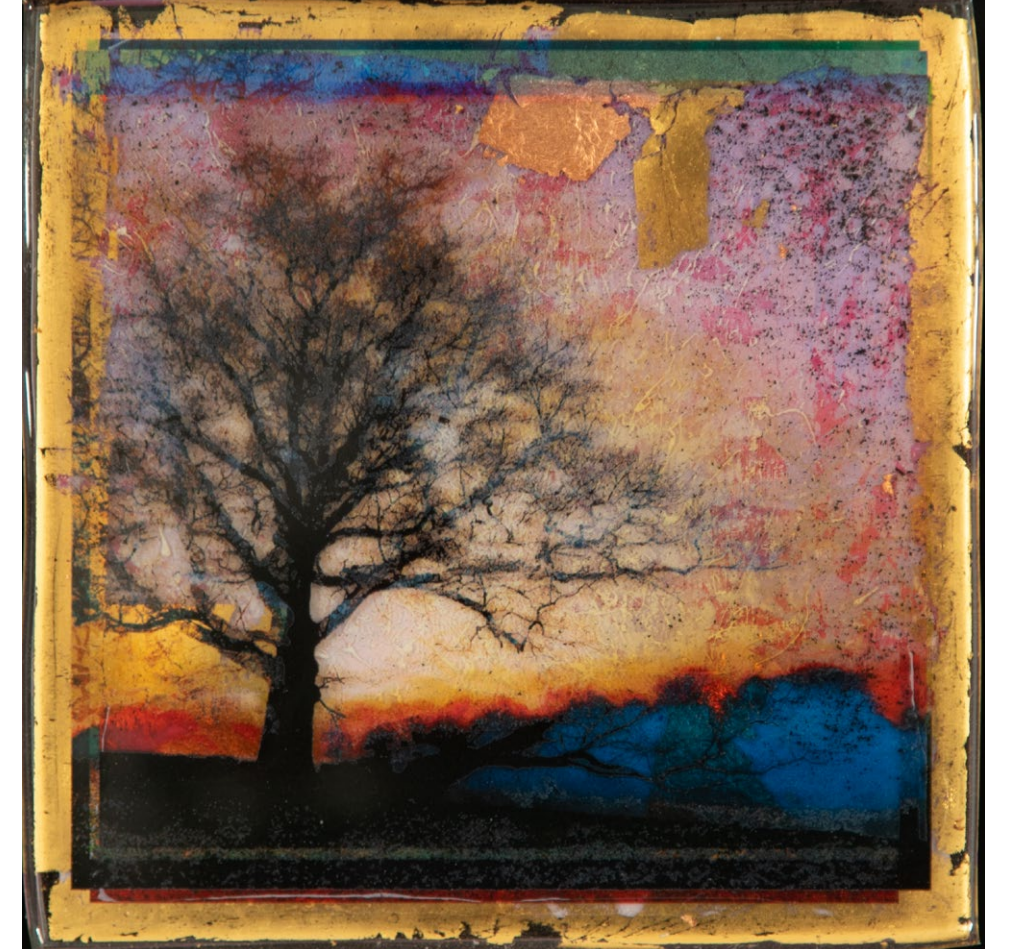
Layers of Memory III