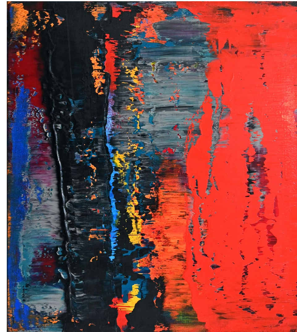
These Days 11

His works are held in private and corporate collections nationally and internationally. He has held Solo shows in the UK, Germany and Switzerland. In 2017 his work was chosen for the Creekside Open & the National Open Art Exhibition and for the ING Discerning Eye competition in 2015, 2016 & 2021 and the Royal Watercolour Society Open in 2024. He is represented by Adam's Gallery, Reigate; Clifton Fine Art, Bristol & the Wilverley Gallery in Lymington.