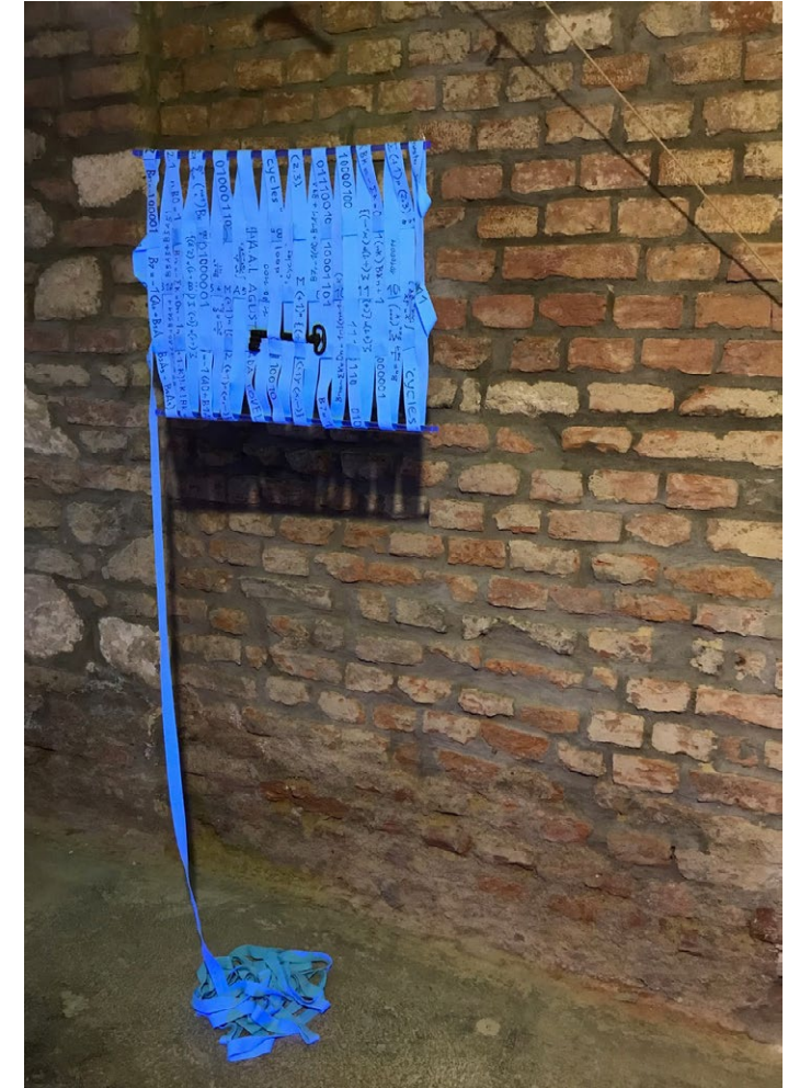
The first key to computer science, tribute to Ada Lovelace