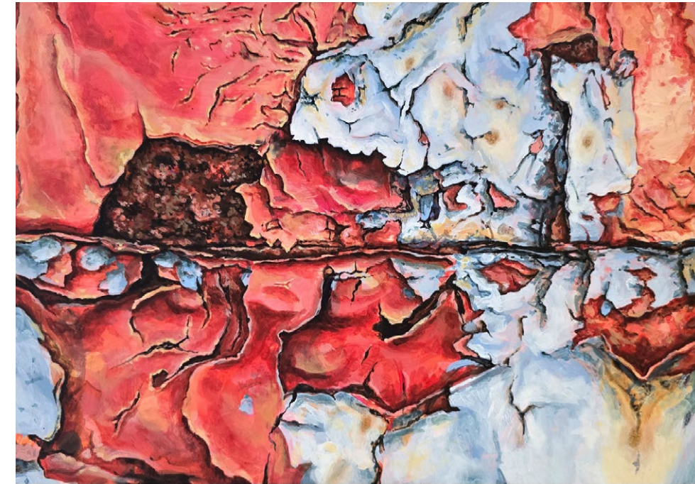
Tractor Paint Peel 2

His works are made through processes of construction, deconstruction, reconstruction, and restoration and he is fascinated by how this may cause us to reflect on our value systems. He uses the physical act of making as a means of thinking, and the outcomes explore the boundaries of imperfection, incompleteness, and impermanence. He lives, teaches and works in London having graduated from Chelsea College of Arts and Staffordshire University.