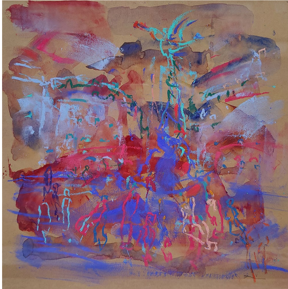
Piccadilly Circus, London