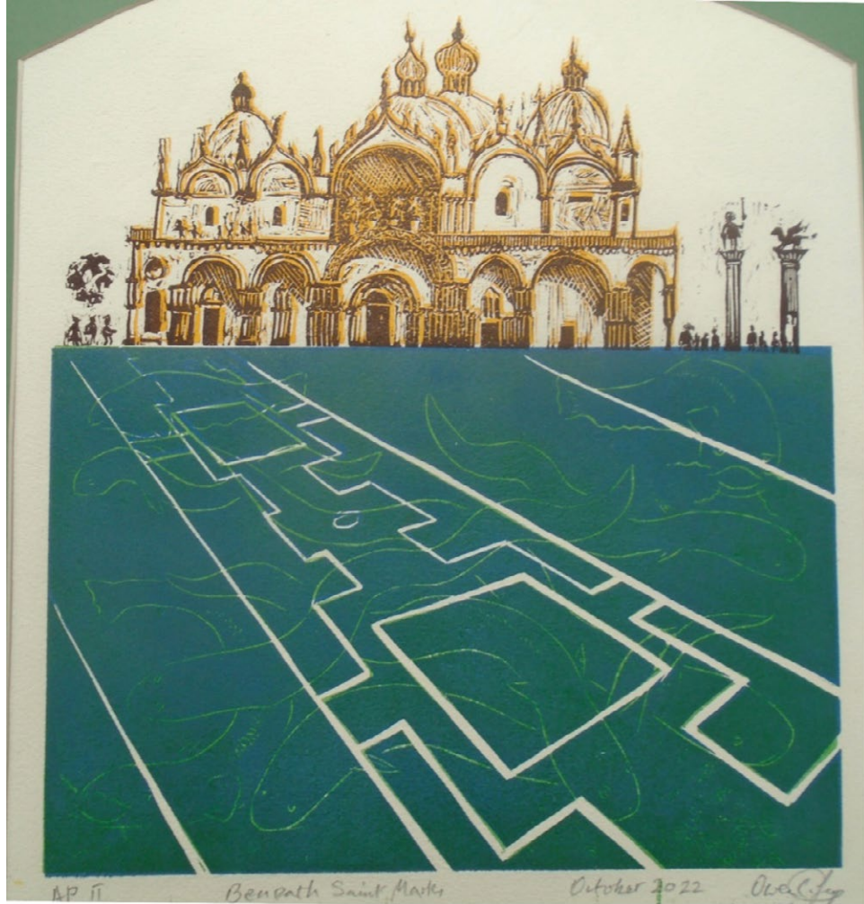
St Mark's Venice, with Fish below pavement

Owen has been an FPS member for fifty six years and specialises in multicolour linocut prints. These illustrate various books which he has published. The text has usually been presented with hand-set type. Other creative work has been 3D wall-hanging sculpture and functional, but decorative furniture.