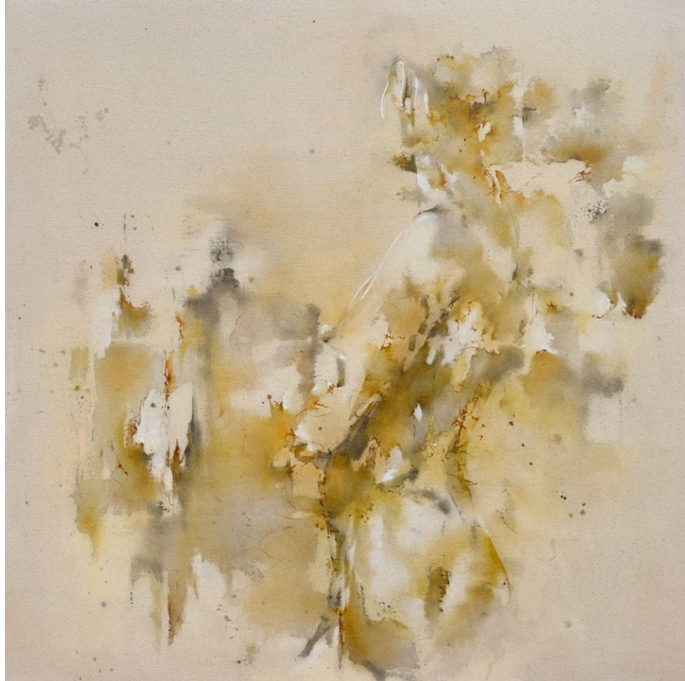
Before the Rain

Central to my practice is a commitment to amplifying women's voices and shedding light on themes of identity, femininity, and societal perceptions of aging and beauty. Through my work, I invite viewers to reflect on the complexities of womanhood, often blending rich symbolism and abstraction to tell personal yet universally resonant stories. Each brushstroke I use, either depicts the shape of the body or one of the many visual marks pertained to the skin as it ages, from thread veins to age spots etc. I'm fortunate to have many friends that model for me, giving me not only diversity but an insight to how many women struggle with their changing bodies. The scars of time can be beautiful if we look at them differently, especially in paint.